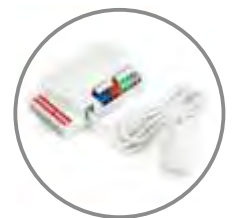
Motion Sensor (0-10vdc dim)