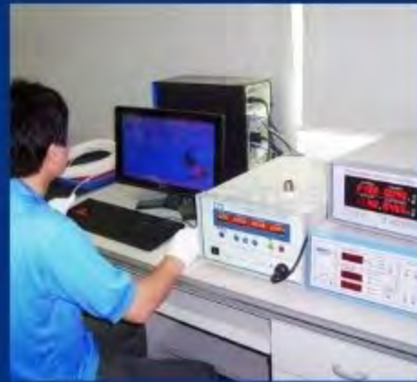
SAFETY STANDARD TEST